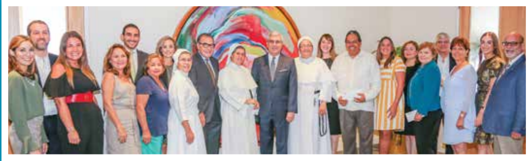
McV Disaster Relief Committee Members and Grant Recipients